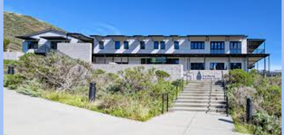
Marine Mammal Center