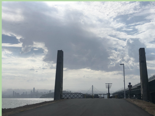
Judge John Sutter Regional Park