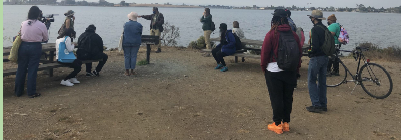
Martin Luther King Jr. Regional Shoreline