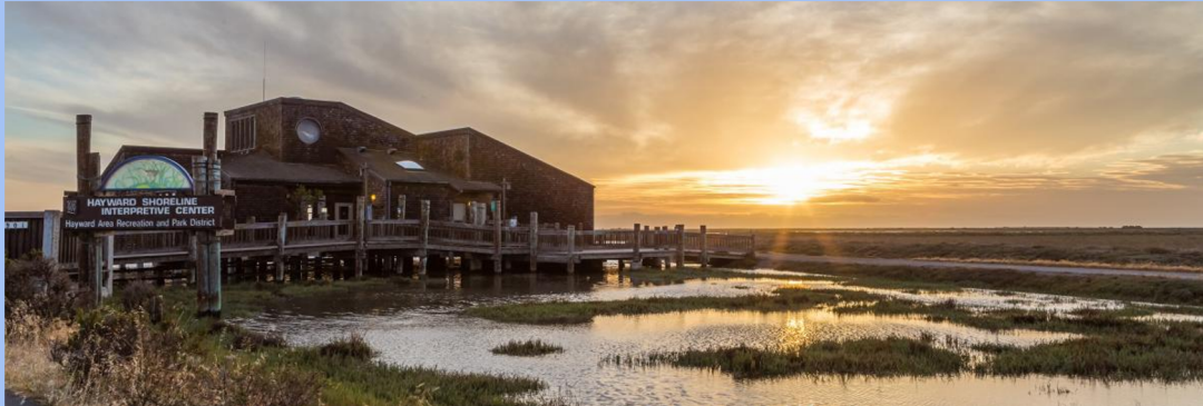
Hayward Shoreline Interpretive Center

$50-75 million [ OUSD Project Fact Sheet : The Center ]