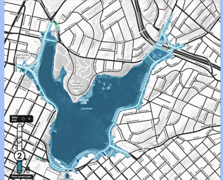
Oakland Geology : A walk around Lake Merritt in 2100, after sea-level rise