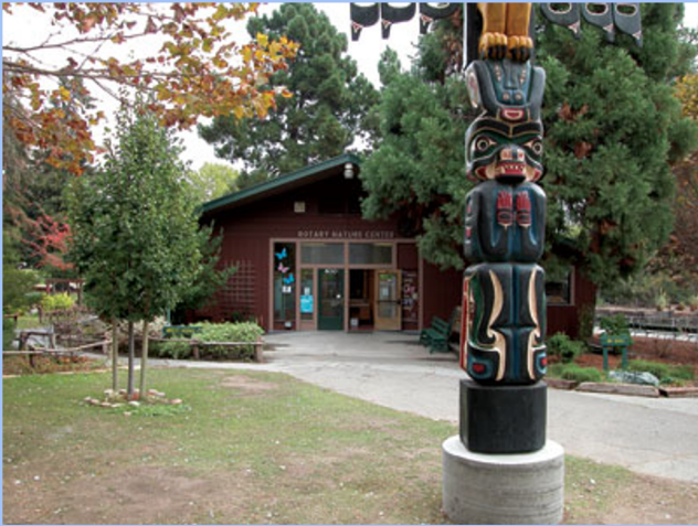
Rotary Nature Center at Lake Merritt